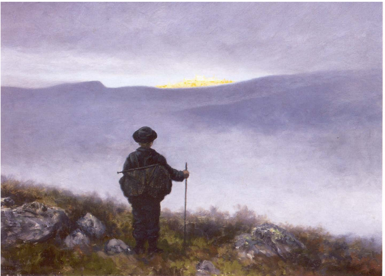
Soria Moria by Theodor Kittelsen (1881)

ANCR 29th - 30th August 2012 Oslo - Norway